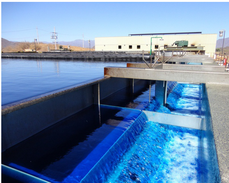
The solvent extraction plant. Blue copper sulfate solution is fed to the electrowinning tanks.