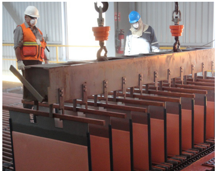
Copper is deposited onto steel cathode plates and is stripped off when it is thick enough. Copper ions in the solution are now copper atoms. Hydrogen ions replace them, turning the electrolyte back to sulfuric acid.