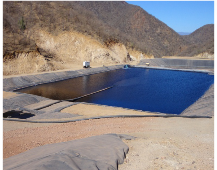
The Pregnant Leach Solution pond. This looks small, but this is a continuous flow process. The pond is needed so that pumps can operate.