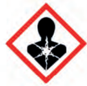
GHS08 (Health hazards)