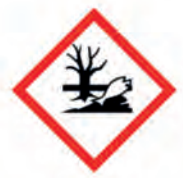
GHS09 (Hazardous to the aquatic environment)

Note: The text under each symbol has been adapted by CLEAPSS ( www.cleapss.org.uk ). It is intended to help users understand the nature of the hazard. It is not intended to replace the official hazard statements.