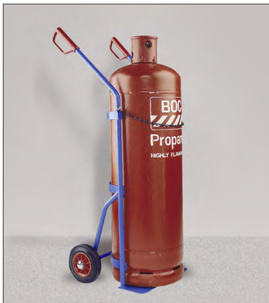
■ Gas cylinder trolley with securing chain