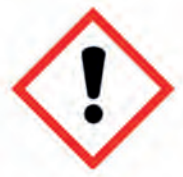
GHS07 (Moderate hazard)