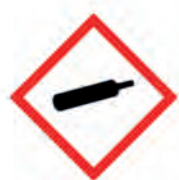
GHS04 (Gas under pressure)