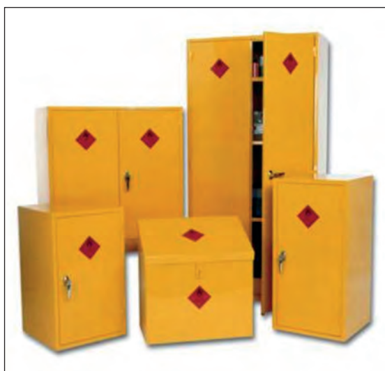
■ Flammables cupboards from Timstar

These flammables should be stored in a metal cabinet, sited inside the Chemicals Store, away from the door so as not to impede exit in case of emergency. The cabinet should have 30 minutes fire integrity and be able to contain spills.