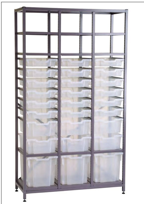
■ Gratnells Treble Chemical Storage Set