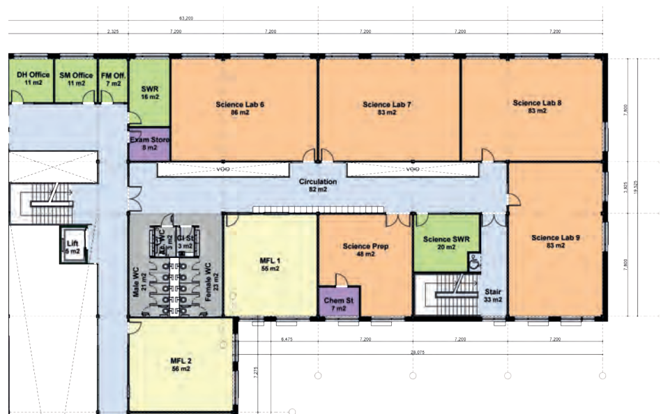
■ Figure A: Typical layout within a science suite

There should be easy access to the central Prep Room, and hence to the chemicals store, for deliveries of hazardous materials (e.g. chemicals and gas cylinders). This access should be separate from pupil circulation areas where at all possible; it should at least be possible to make it secure during deliveries.