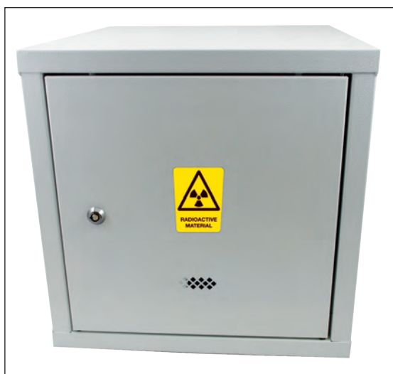
■ Radioactive cupboard from Timstar

Ideally, the cabinet should be sited in a separate, secure store that is used for science apparatus, stationery, or similar. If the central Prep Room is large enough, the 2m (or 3m) limit may be satisfied in a remote corner. The secure store or Prep Room should only be accessible by science staff.