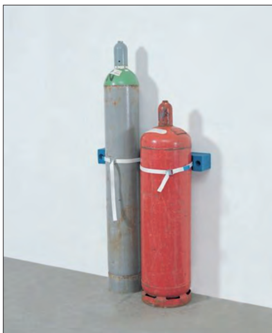
■ Gas cylinders with wall fixing brackets and securing straps