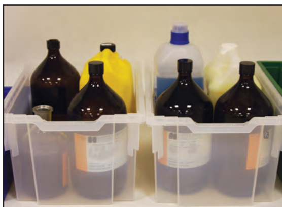
■ Chemical containers in plastic trays

This can be done by using deep plastic trays, which provide for flexible arrangements, or a more permanent plinth (or raised shelf) with a channel around it filled with inert, absorbent material.