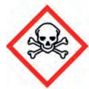
GHS06 (Acutely toxic)