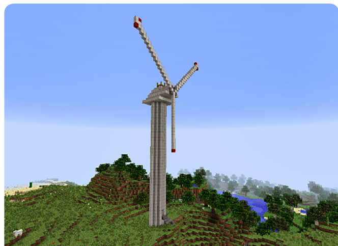
Figure 2 A wind turbine built with cubic blocks in the virtual world of Minecraft

A challenge faced by the project is reaching girls. Surveys of attendees at public events and in school settings