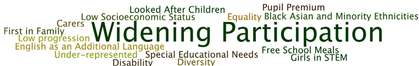
Figure 1 'Widening Participation' aims to support people from a range of groups who may experience barriers to accessing education